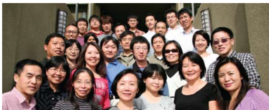
Group of SABPA

here: http://www.sabpa.org/web/news_details.php?ID=200